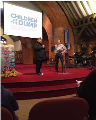
St Paul's Church