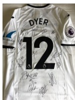
Swansea FC signed shirt