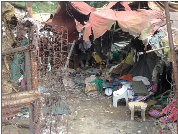
A typical home for families living around the dumpsite. Note the springs from the mattress that forms the front door.