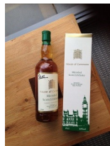
House of Commons whisky