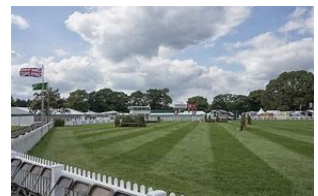
Hospitality tickets at Ringwood Brewery Marquee, New Forest Show